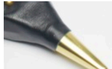
BRASS NAILS & NOZZLES